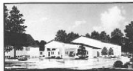
Proceeds Benefit Concordia's Family Life Center!